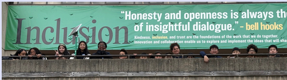
White Street School Scholars at Holyoke Community College

WSS young scholars enjoyed a field trip to Holyoke Community College at the end of March. Five mentors and 16 young scholars, including the newest young scholars, visited all the different buildings, learned about the various student support services available and they learned that attending HCC is free! Transferring to a 4 year college after graduating from HCC can significantly reduce the total cost of a college education. After a pizza lunch, the young scholars were able to ask questions to a panel of current students about college life at HCC.