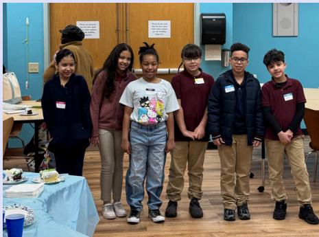
The new MLK young scholars

Six new young scholars at MLK Charter School were chosen in March, joining the existing 6 young scholars at MLK. Along with the new scholars, we also welcome 5 new mentors, all teachers at MLK. After a lively assembly with music and plenty of cheering celebrating academic dedication and performance, the young scholars, their families and mentors gathered for cake and celebration.