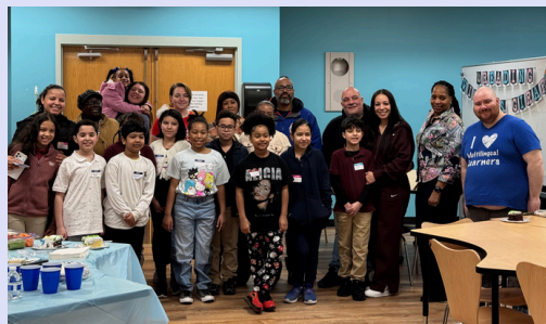
Welcome to the Young Scholars' family!